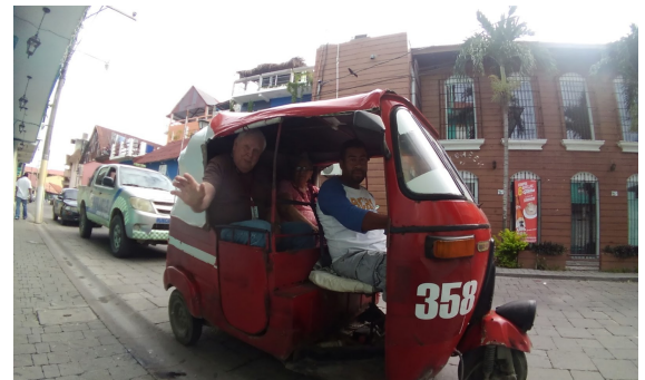
$1.00 US taxi to town

Day 4. Tikal Guatemala ruins. The group boards a private bus to explore the amazing Tikal Ruins “A city of ancient Maya Civilization”. Tikal is a large archaeological site in Guatemala, the largest excavated site in the Americas. It is Guatemala’s most famous cultural and natural preserve, and is located in the department (state) of El Petén. Baja Bush Pilots explore and spend the day taking in the site in its totality.