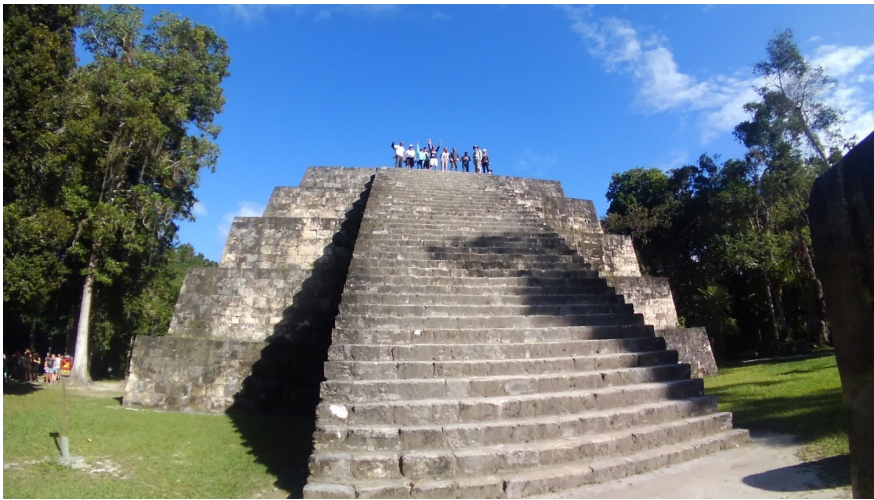
Baja Bush Pilots on top!