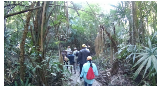
Exploring the jungles of Tikal