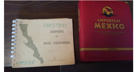
Airports of Mexico and Central America Flying Guide.

Veracruz México. An airport of entry with 100ll fuel. Paperwork is completed and off to the hotel $10. US taxi ride to the “Gran Hotel Diligencias”. Some explore the markets and local attractions in this busy traditional Mexican town.