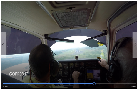
Short final. Veracruz MX.

The Baja Bush Pilots literally wrote the book on flying Mexico and Central America by publishing the 28th edition of Airports of Mexico and Central America flying guide.