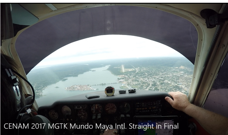
CENAM 2017 MGTK Mundo Maya Intl. Straight in Final

Guatemala. Descending over Lago Peten Itza in route for Mundo Maya International after a 2.5 hour flight the small island town of Flores is a spectacular sight. Mundo Maya international has no 100ll fuel but does have friendly customs and flight services. This airport is the primary airport for those wanting to see the Tikal Ruins. A $1.00 (one dollar) US ride to town in a three wheel taxi to the island city of Flores. This city now has a causeway but is still considered an island city by most. The people here are warm and friendly. I tried to give the taxi driver a $5.00 U.S. for the ride from the airport to the hotel and he said no.. after talking to him he said that was just way too much and was extremely happy with the $2.00 us we settled on.